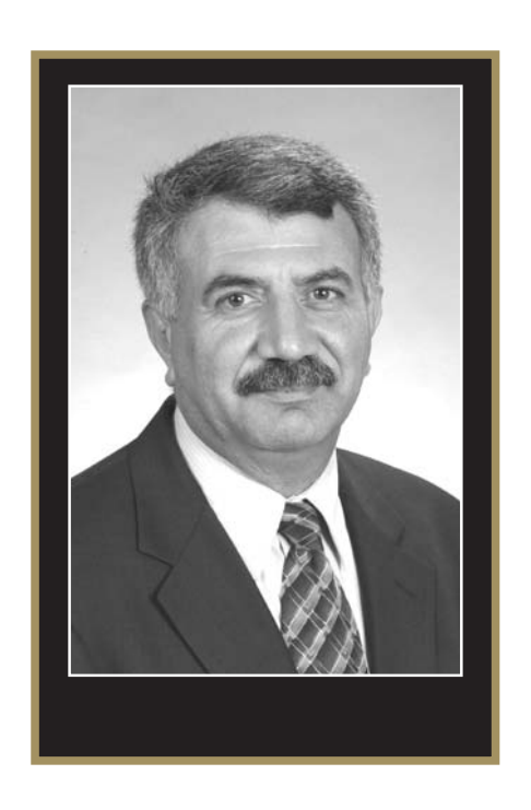
Presentation of Gold Medal for Personal and Professional Excellence to: